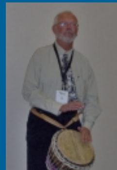
☝ Above, Presenting At "Vitalize" 2009 ☝